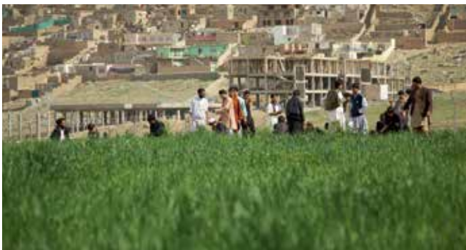
National Agriculture Education College (NAEC) students doing fieldwork near Kabul.

Certain traditional community-based organizations in Afghanistan have existed for centuries and survived decades of war and foreign intervention, for example the Mirab